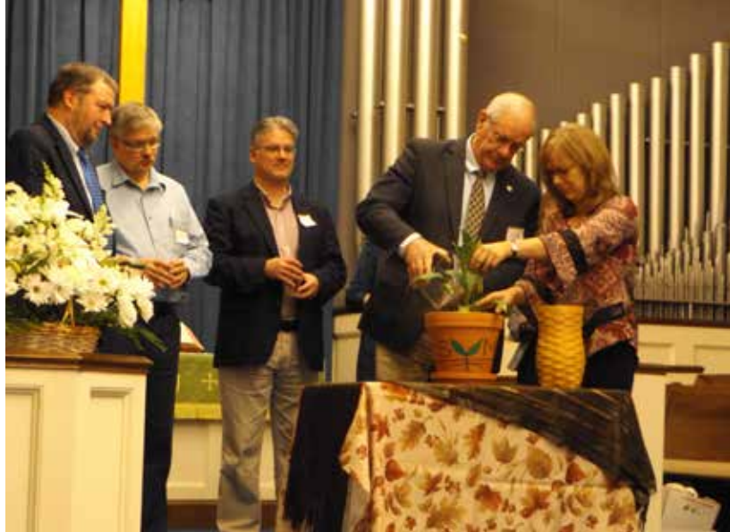
Representatives of SVMC’s various partners share in a “ritual of blessing,” combining small containers of soil into a pot that will hold a peace lily at SVMC’s office, located at Elizabethtown (Pa.) College.