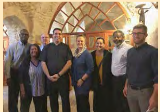
CMEP delegation at Saint Georges Cathedral in Jerusalem.